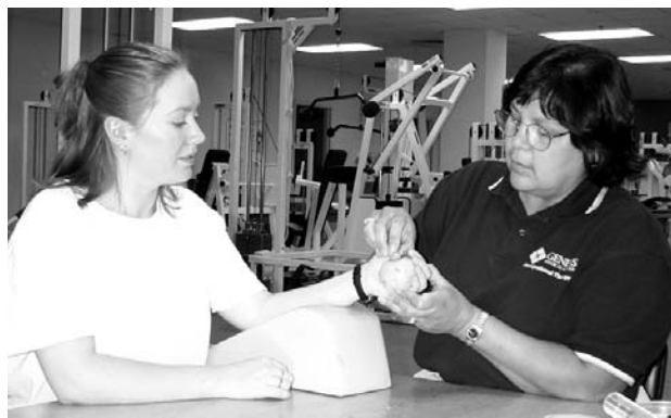
Occupational Therapy focusing on hand injuries

Social Services assists with several support groups as well as confidential counseling for a variety of social and emotional problems you may need help resolving. Several outreach activities have included: golf, bowling and gardening.