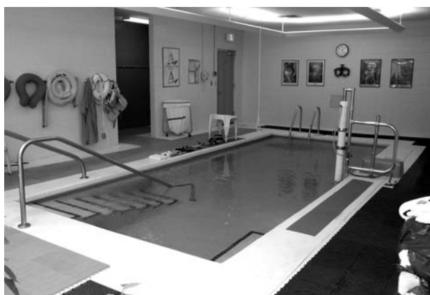
Warm Water Aquatic Facility in Bettendorf, Genesis Plaza

Therapeutic Recreation Therapy plans, organizes and directs recreation programs to assist you in developing interpersonal relationships, increasing involvement in leisure activities, learning the local transportation system and developing the confidence needed to participate in group activities. The goal of therapeutic recreation is to help you return to activities in your community.