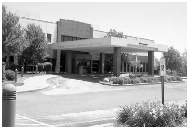
Genesis Plaza, Bettendorf, IA

For more information on our programs and our two convenient locations, please call (563) 421-3460 for our Bettendorf location or (563) 421-3495 for our Davenport location.