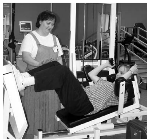
Cybex strength training equipment in Bettendorf, Genesis Plaza